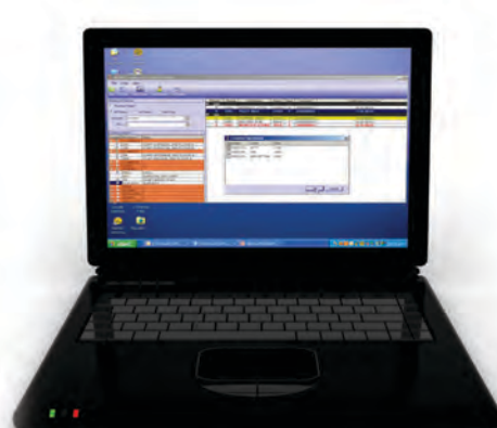
Mobile Carts and Bedside PCs