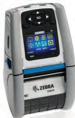
Zebra ZQ610 Portable Printer